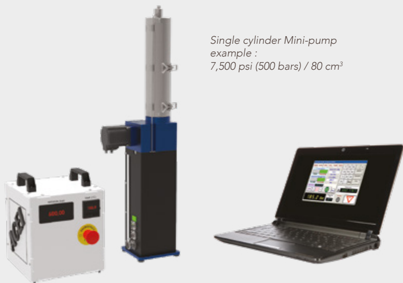
Single cylinder Mini-pump example : 7,500 psi (500 bars) / 80 cm 3