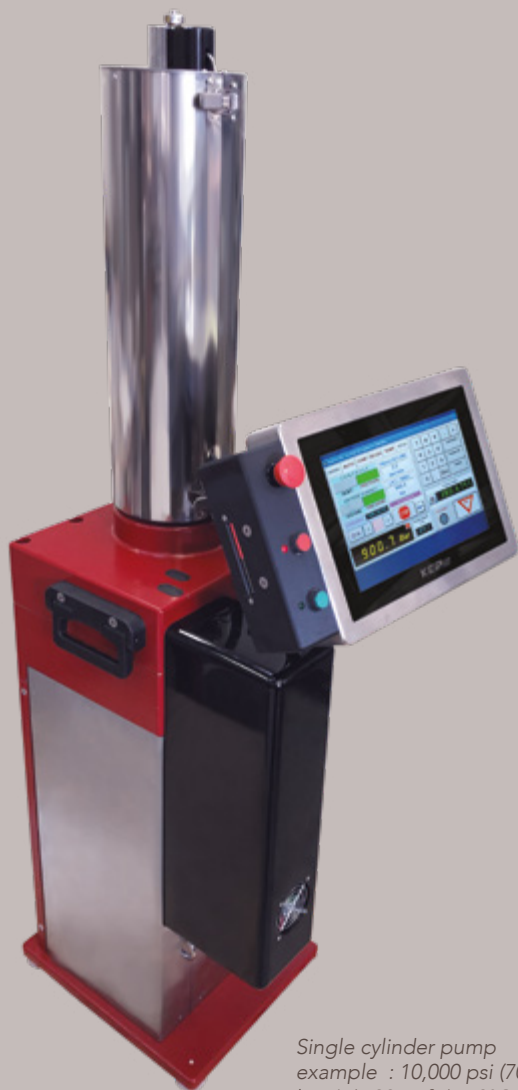
Single cylinder pump example : 10,000 psi (700 bars) / 120 cm 3 / 150°C